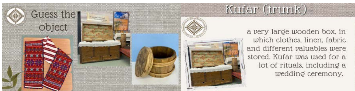
Fig. 2. The interactive visual game «Guess the Object»

In order to prove the hypothesis of our research the experiment has been conducted. The students of the 9th and 11th forms were given the essay topic «Promoting Belarusian traditions and crafts among young people» and asked to analyse visual texts working with the handout «Traditional Belarus» based on the results of our research. The experiment group was also asked to play the visual game «Guess the object» to develop their critical thinking skills, and evoke interest in the topic. The game «Guess the object» consists of 18 slides and includes 7 historical objects of the Belarusian History and Local History Museum located in Gymnasium № 25 named after Rimma Shershneva (fig. 2).